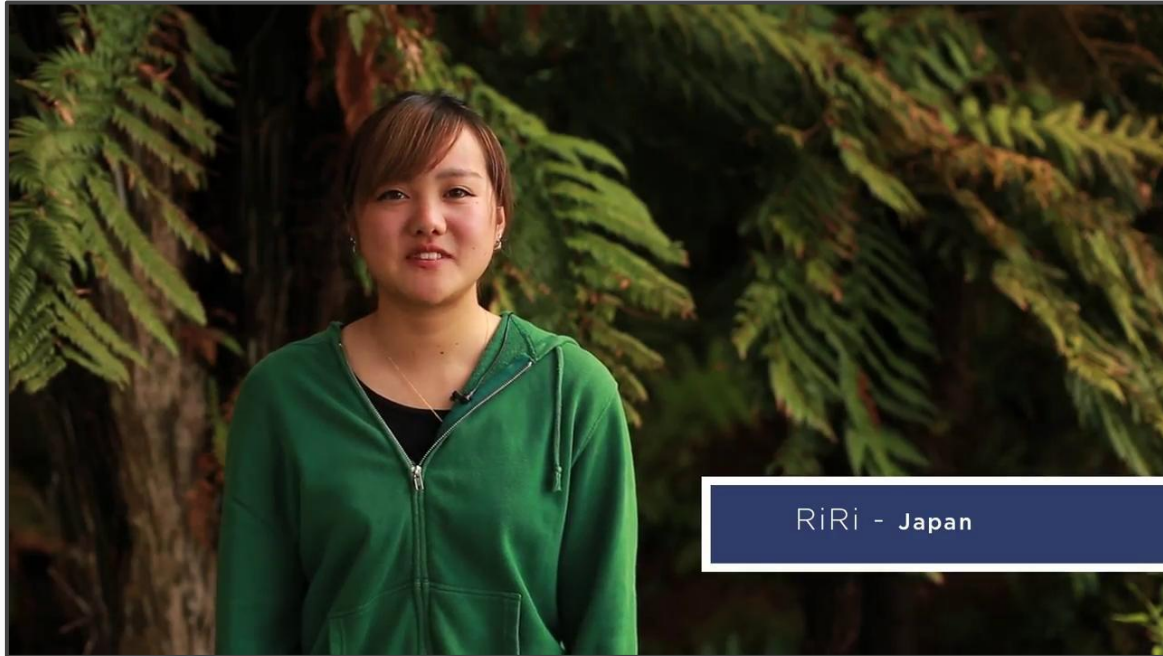
RiRi - Japan